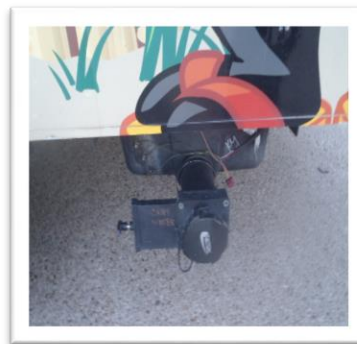
Liquid Waste Connection