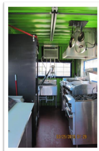
Smooth and cleanable surfaces