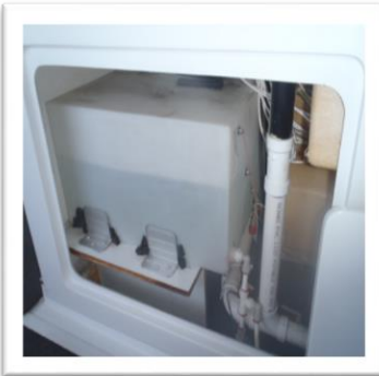
Potable Water Tank